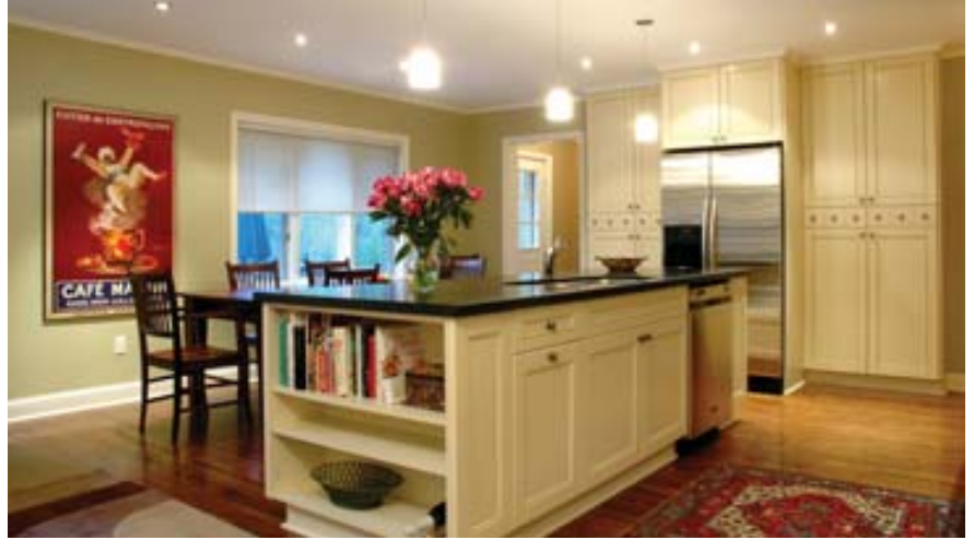
Bravehart Building 416.410.1616/Bravehartbuilding.com